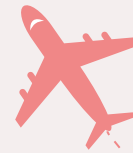
📍 PUERTO VALLARTA

Alfaparf Milano wouldn't be the same without its hairstylists, its ALFAPARFPEOPLE! Being together and building a team is in our DNA. Every year, we organize brand events, participate in industry fairs around the world, and actively take part in the most important hair industry events. We look forward to seeing you at the next event!